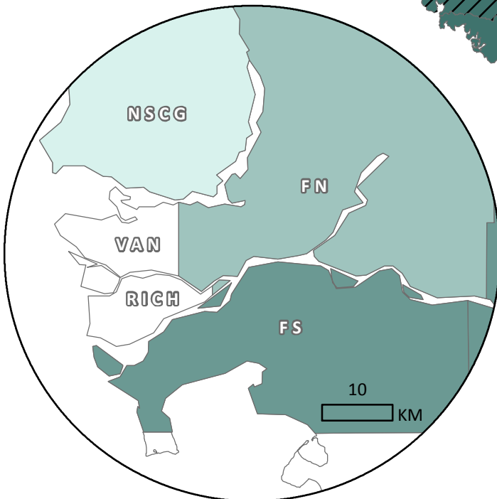
Lower Mainland inset

BC Centre for Disease Control AN AGENCY OF THE PROVINCIAL HEALTH SERVICES AUTHORITY